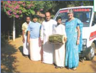
The ambulance is blessed with a Puja.