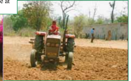
Topsoil is needed for the newly levelled playing field and school playground.